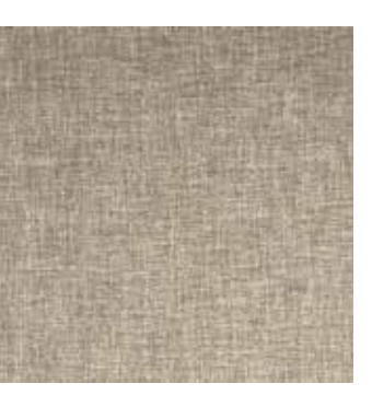
Cotton Chic Hazlenut