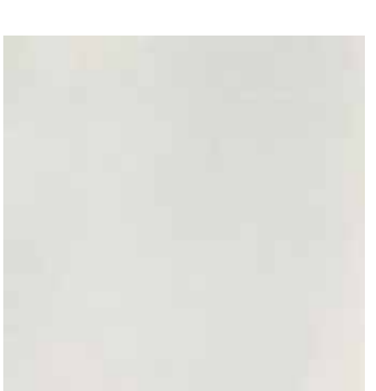
Cotton Chic Ivory