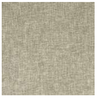
Cotton Chic Bark