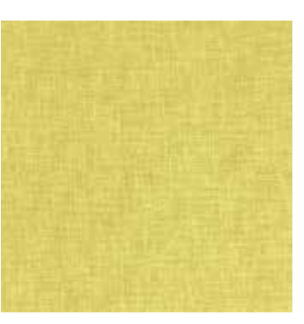
Cotton Chic Chartreuse