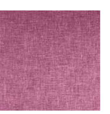
Cotton Chic Damson