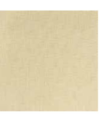
Cotton Chic Champagne