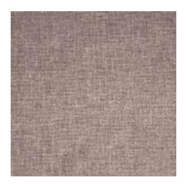
Cotton Chic Espresso