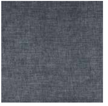
Cotton Chic Charcoal