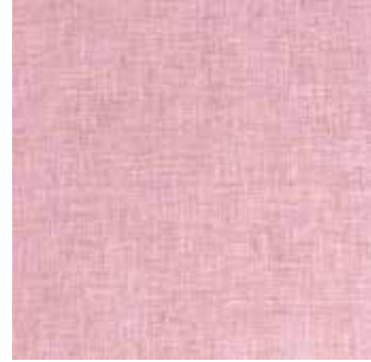
Cotton Chic Vintage Rose