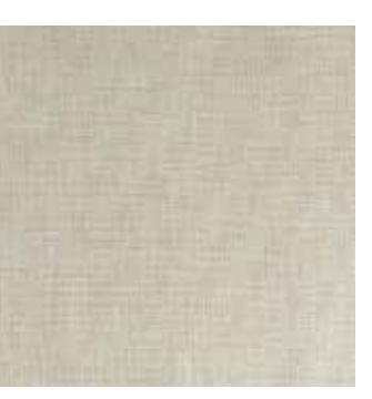
Cotton Chic Sand