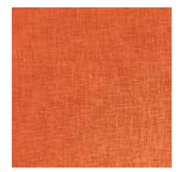
Cotton Chic Spice