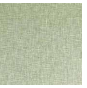
Cotton Chic Sage