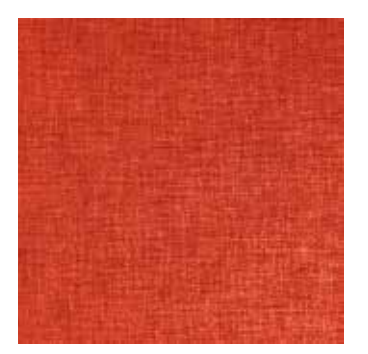
Cotton Chic Ruby