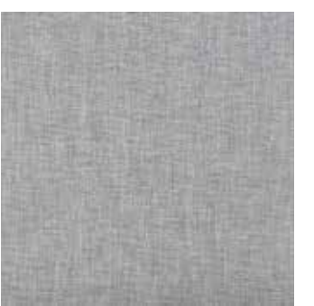
Cotton Chic Taupe