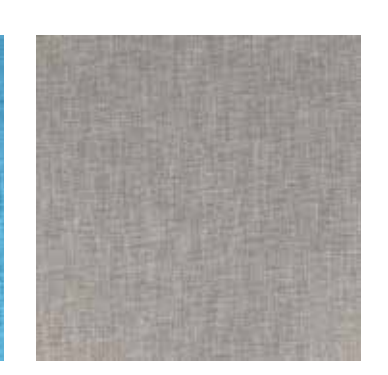
Cotton Chic Linen