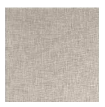
Cotton Chic Jute