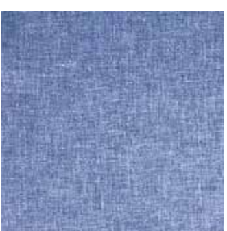
Cotton Chic Denim