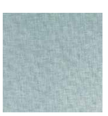
Cotton Chic Duck Egg