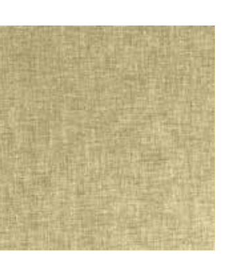
Cotton Chic Sable