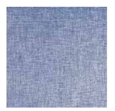
Cotton Chic Chambray