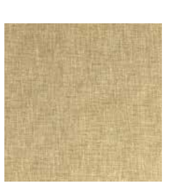
Cotton Chic Hemp